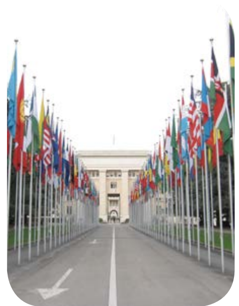
Palais des Nations, Geneva