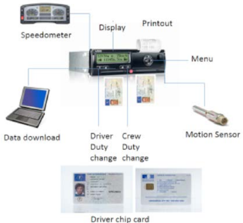
Tachograph by Continental and Chip cards by Chronoservices

modifies Article 23 of the CMR Convention to introduce Special Drawing Rights (SDR) as the currency reference for the calculation of compensation due in case of damage to the goods. Contracting Parties on 31 March 2013: 41 States, of which 3 are EuroMed (Jordan, Lebanon and Tunisia).