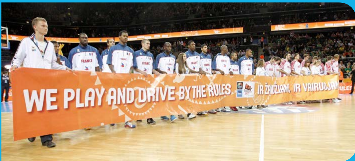
EUROBASKET 2011 LITHUANIA, Semifinal game, France vs Russia: FIBA, FIBA EUROPE, UNECE, Ministry of Transport and Basketball Federation Lithuania Road Safety Campaign

international traffic. The Convention is crucial for facilitating international road traffic, international transport and trade as well as tourism. Contracting Parties on 31 March 2013: 72 States, of which 3 EuroMed (Israel, Morocco and Tunisia).